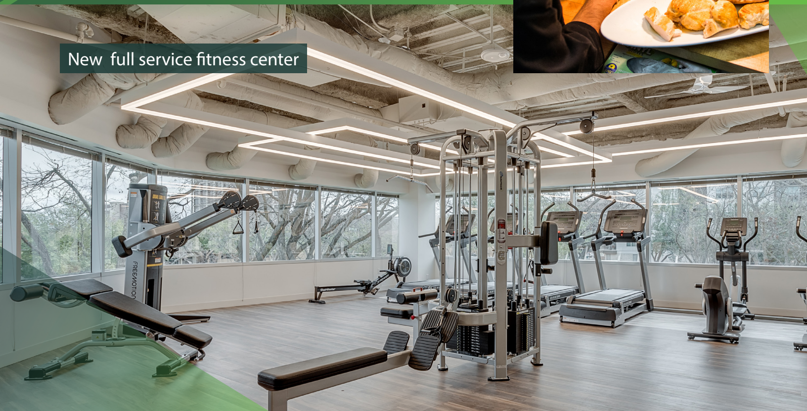
New full service fitness center