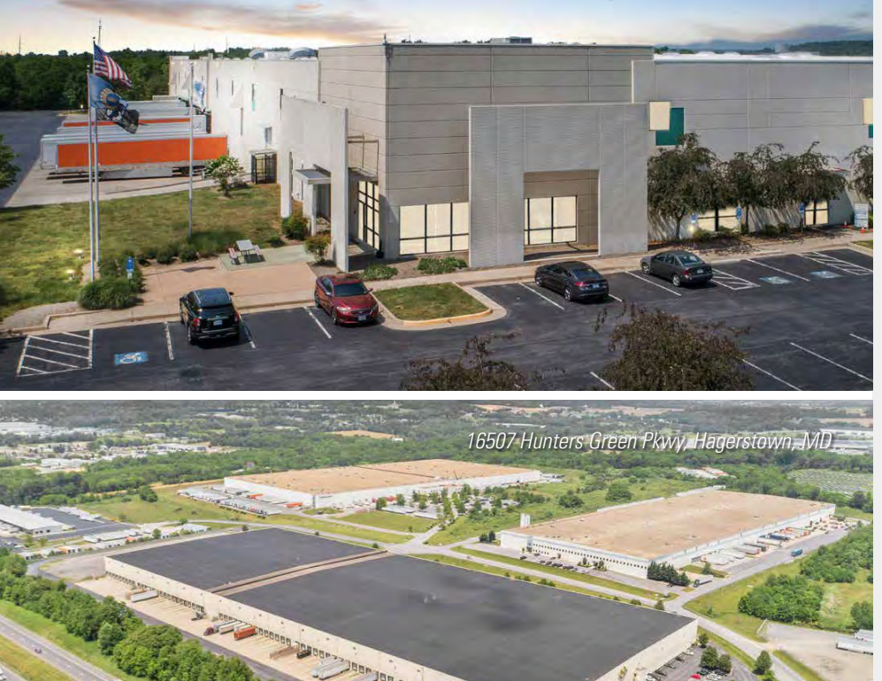
70 Shady Elm Road, Winchester, VA