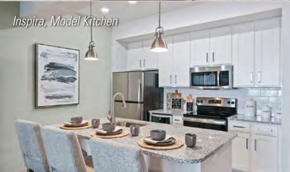
Inspira, Model Kitchen