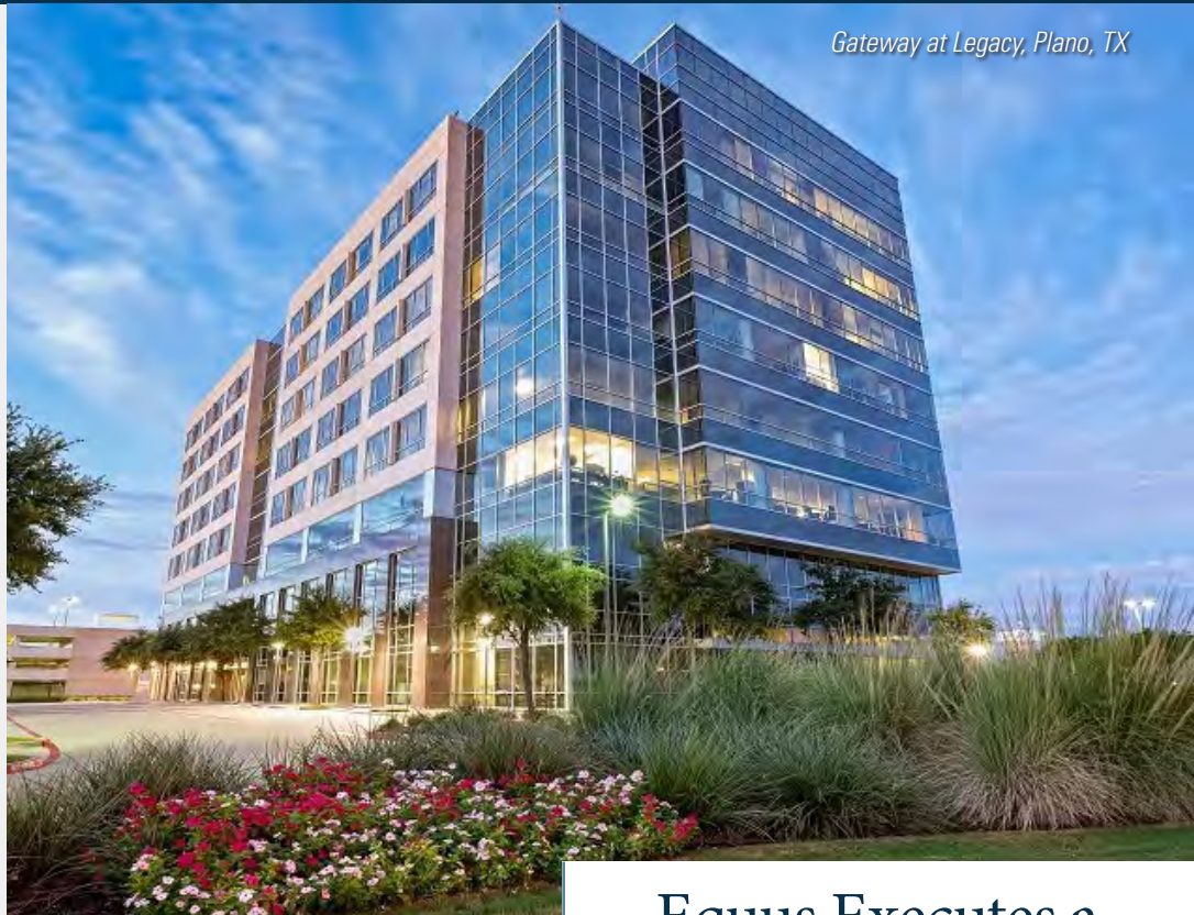
Gateway at Legacy, Plano, TX

Market conditions and real estate fundamentals remain favorable for investment activity. Continued positive job creation, economic expansion and accommodative Federal Reserve monetary policy each contributes to steady demand for commercial space. Historically low unemployment bodes well for residential demand. Migration trends, job creation and manageable supply additions in our targeted markets result in positive absorption and rental